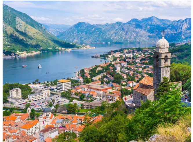
Bay of Kotor, Montenegro