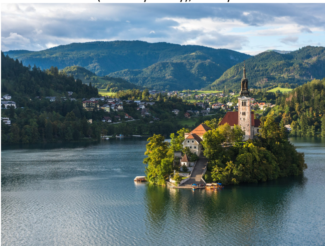
Lake Bled, Slovenia