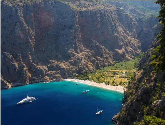
Kelebekler Vadisi (Butterfly Valley), Turkey