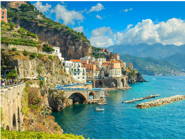
Amalfi Coast, Italy